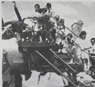
Almost every family member had to look at the F-4D on display.