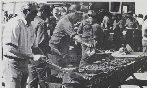
Members of CAMS took care of the cooking chores - the well received, excellent & abundant food was proof positive that they do other things just as good as they fix aircraft.