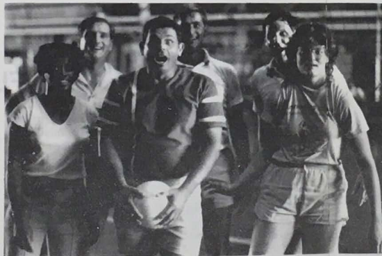
Volleyball ended at 5:15 p.m. with the final match-up games between Group headquarters and Civil Engineering. Group then went on to win the second game. In the third game, Group skunked CE and won the championship.